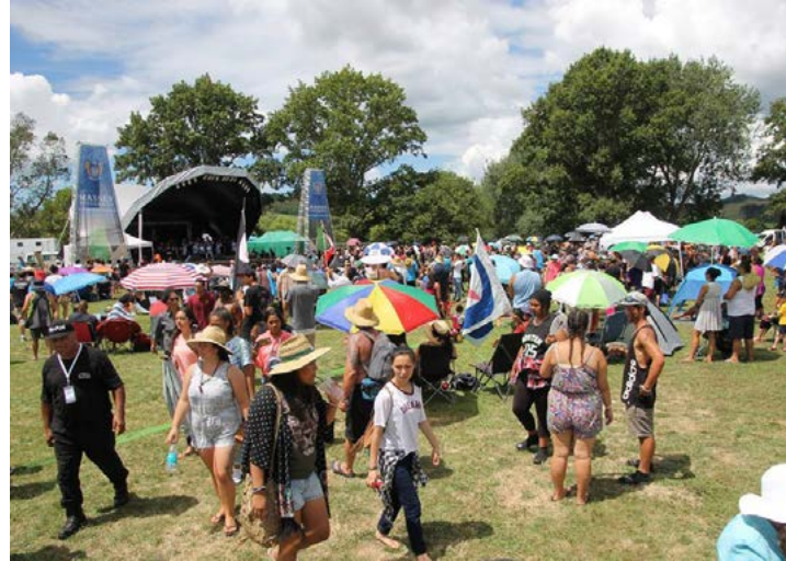
Whānau enjoying the live entertainment at Ngāpuhi Festival 2016

The festival could not be delivered without a strong workforce behind the scenes, from stage hands, to the exhibition set up crew, through to the clean up of the grounds. I thank the Northland College Board of Trustees and their staff for their continued support of the festival, and allowing the Rūnanga to hold Northland's largest free music, arts and cultural festival on their school grounds.