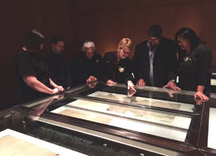
A rare opportunity to view the original Treaty of Waitangi